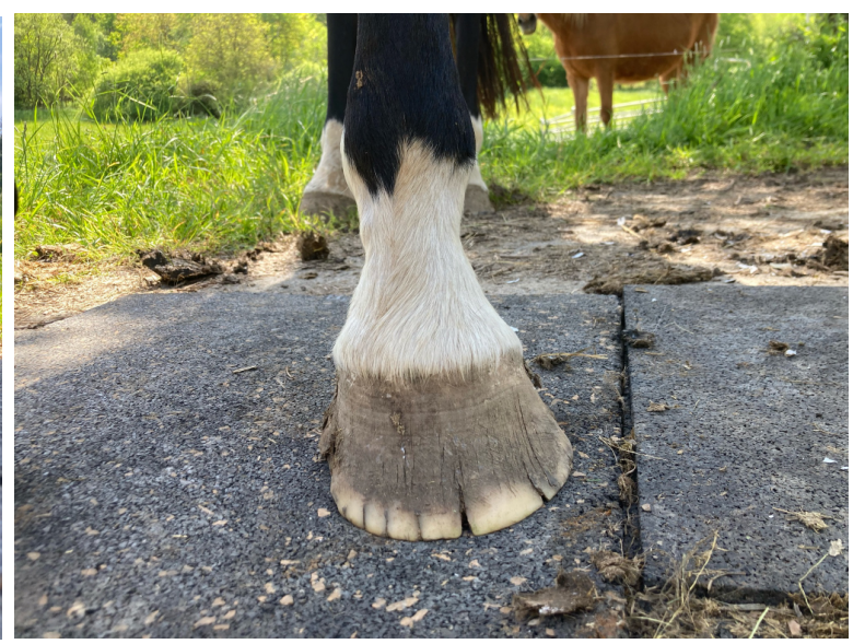
19.mai.2023 flairing walls - cracks - stretched white line